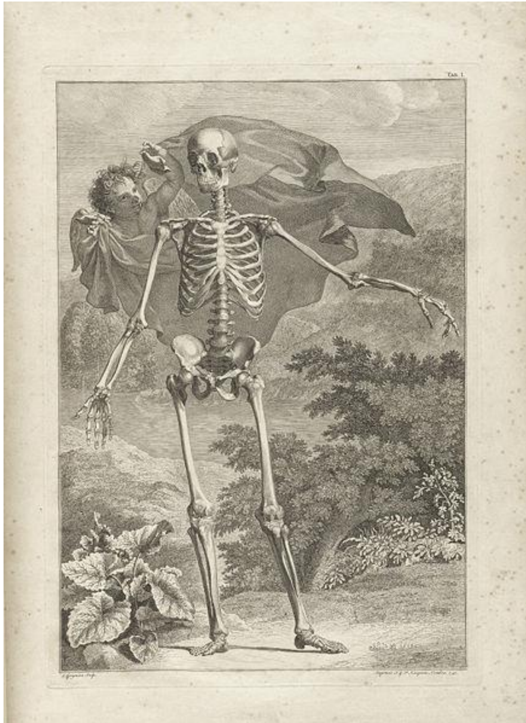
Published 1747, Bernhard Sigfried Albinus (German born, Dutch medical professor/anatomist) with Jan Wandelaar (artist and engraver).